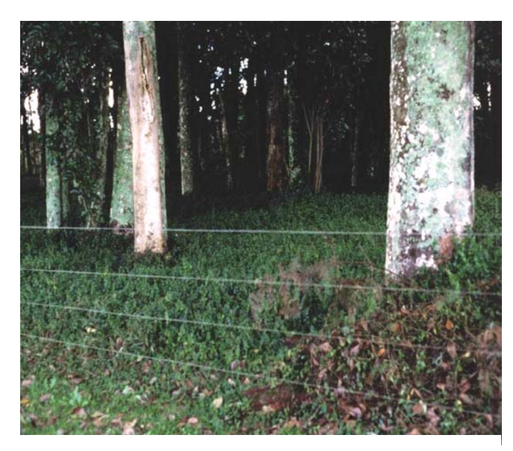
Tradescantia smothering the floor of a Taraire remnant near Maungatapere

Feral cats, goats, ferrets, weasels, stoats, rats and rabbits can also cause significant damage to native ecosystems.