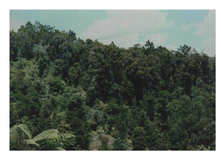
Unmodified mature podocarp forest at Utakura

Volcanic broadleaf forests have been severely depleted and now occur only as small fragmented remnants or individual trees on rich volcanic soils in the Whangarei and Kaikohe districts.