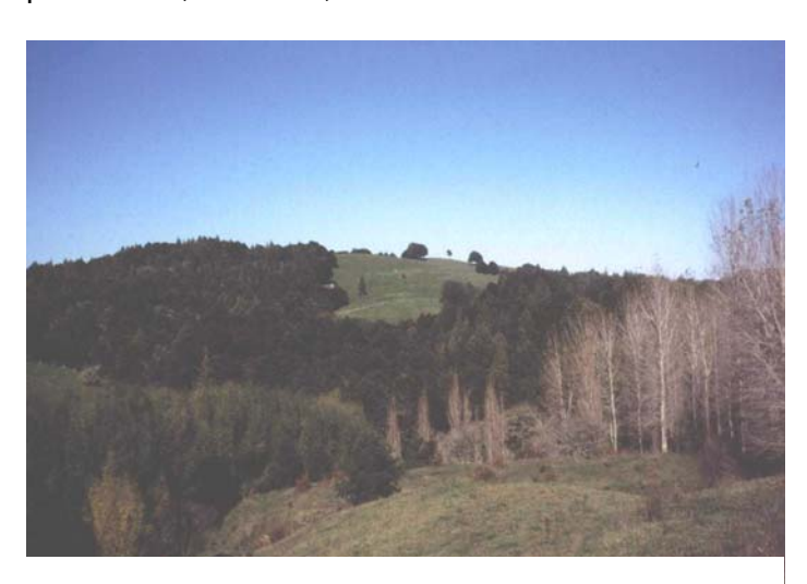
Kauri-Podocarp remnant at Kaiwaka Department of Conservation

The remaining habitats in Northland are small and fragmented. This increases the pressures from surrounding land uses. Natural ecosystems rely on interaction with neighbouring areas of sufficient size to maintain the processes that drive them. As habitats are destroyed, they are separated into 'habitat islands' separated by pasture, plantations, orchards, roads or urban settlements.