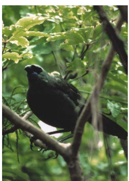
North Island kokako at Puketi Forest, Northland

There are many other threatened species, including the kauri snail, fernbird, spotless crake, bittern, Hochstetters frog, New Zealand pigeon, and a whole host of plants including threatened ferns, orchids, shrubs, small herbaceous plants, sedges and rushes.