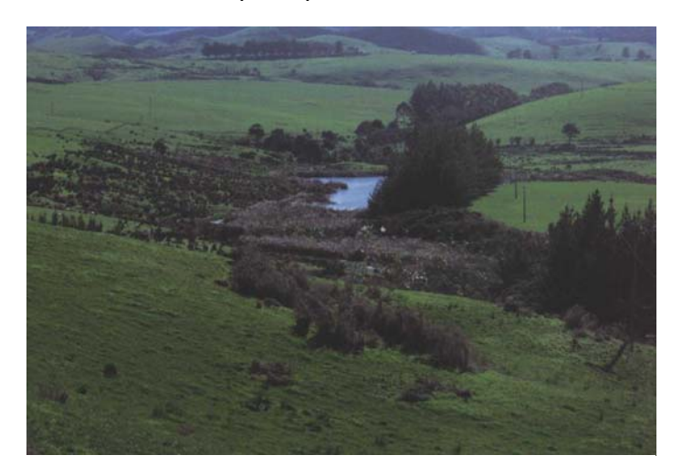
Wetland with spotless crake and waterfowl habitat

Remaining wetlands are under pressure from drainage, fertiliser and animal wastes runoff, water abstractions, clearance of riparian and catchment vegetation, pine planting and logging, weir and dam construction, grazing and trampling of littoral vegetation by stock, and invasion of plant pests.