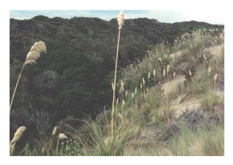
Duneland forest on the Pouto Peninsula

Duneland forests remain on the Aupouri and Pouto Peninsulas.