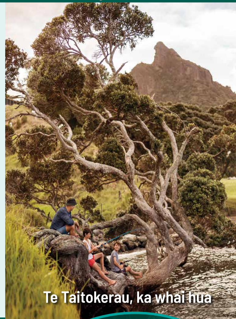
Te Taitokerau, ka whāi hua

0800 002 004 www.nrc.govt.nz/rates 24/7 Environmental Hotline 0800 504 639