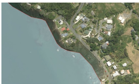
Example of mapped layer coinciding with Indicative mean high water springs line: