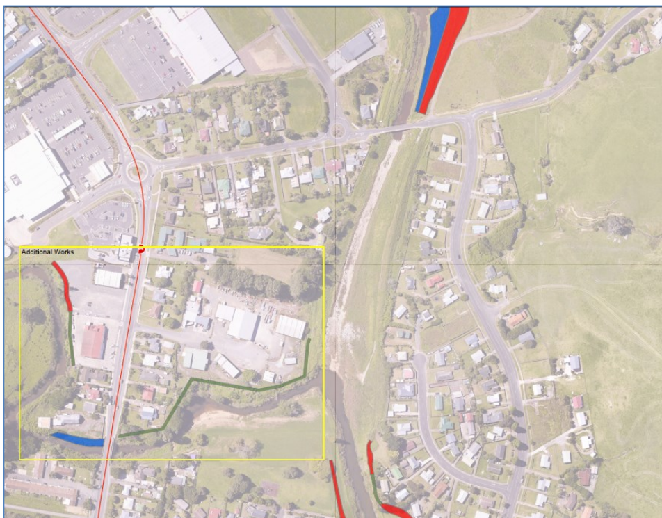
Figure 1: Proposed new works: