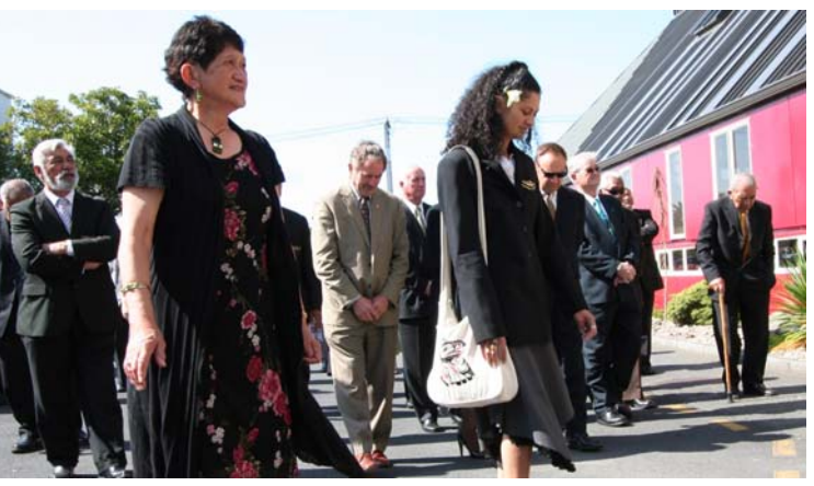
Councillors and supporters are formally welcomed to the Regional Council during a powhiri for the newly-elected Councillors.