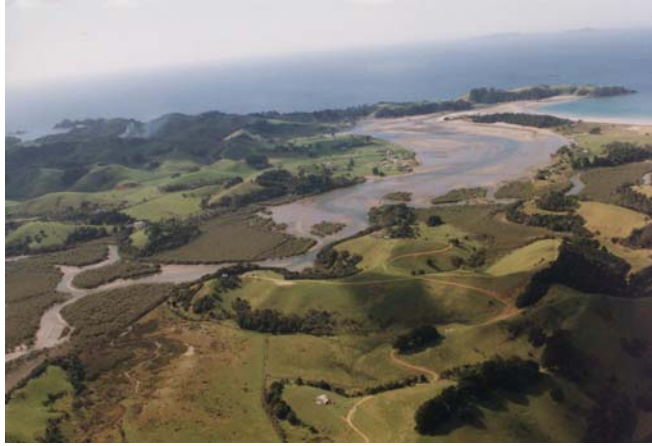
Typical Northland estuary

situated along the west coast, having been formed between stabilised sand dunes. There are also several shallow inland lakes which originated through the damming of valleys by lava flows.