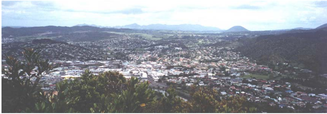
Whangarei City viewed from Mount Parahaki

Northland is the least urbanised region in New Zealand (Statistics New Zealand, 1999). Only 52 percent lived in urban areas in 1996. Over the last 10 years Northland's usually resident population has become increasingly rural. There were 45 percent of people living in rural areas in 1986, compared with 48 percent 10 years later. The fastest growth has been in the Far North district which has a large rural population base. The growth can partly be explained by the high population of Maori in the area (Maori generally have higher birth rates) and the return of Maori to ancestral lands.