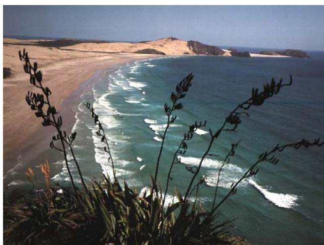
Cape Maria van Diemen

The west coast of Northland is exposed to almost continuous onshore oceanic swells that cause turbulence, turbidity and sediment movement in shallow marine and intertidal habitats. Marine species occupying this type of environment are consequently few and hardy.