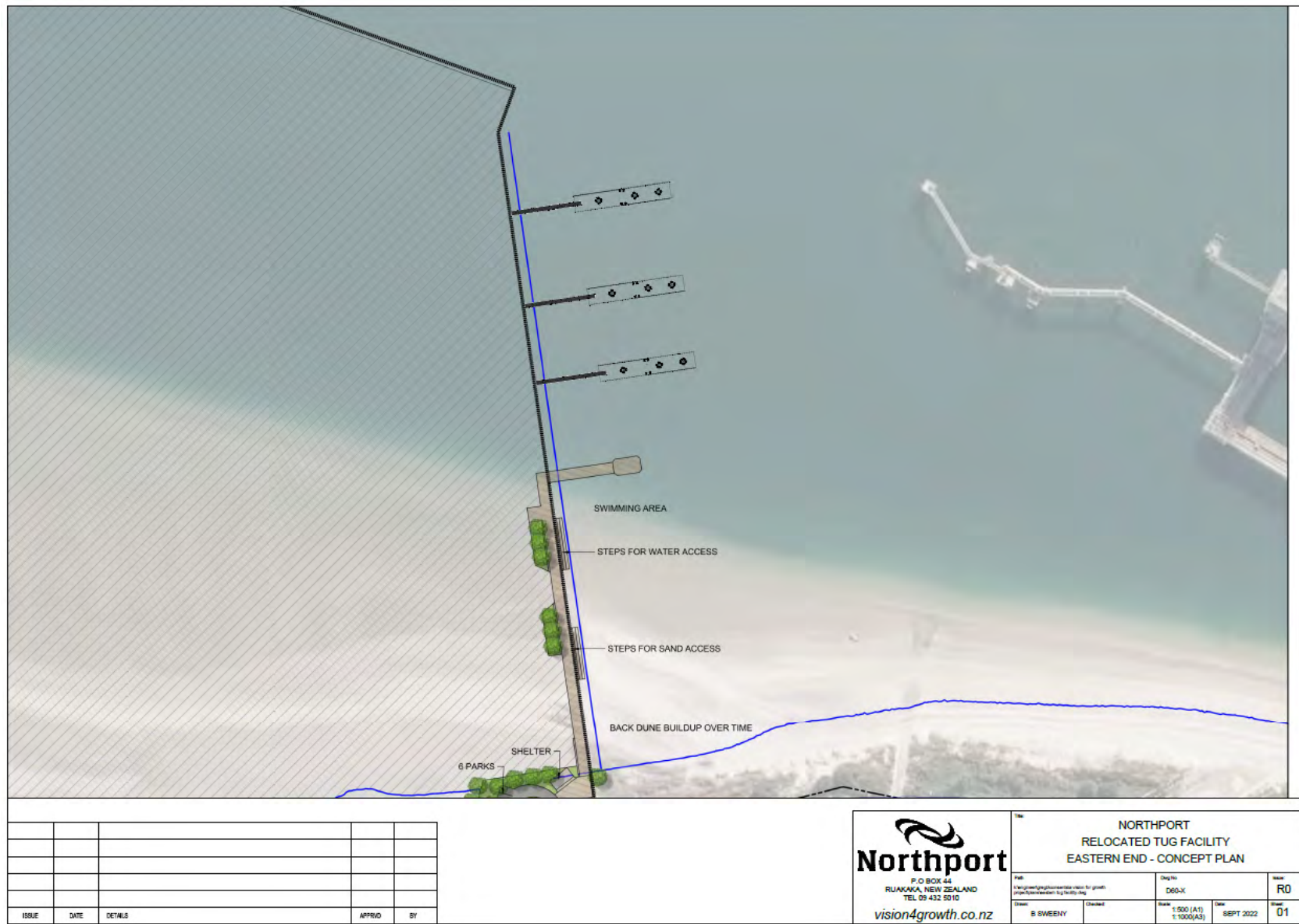
Conditions proposed by Northport (NRC) (25-83.10.23)