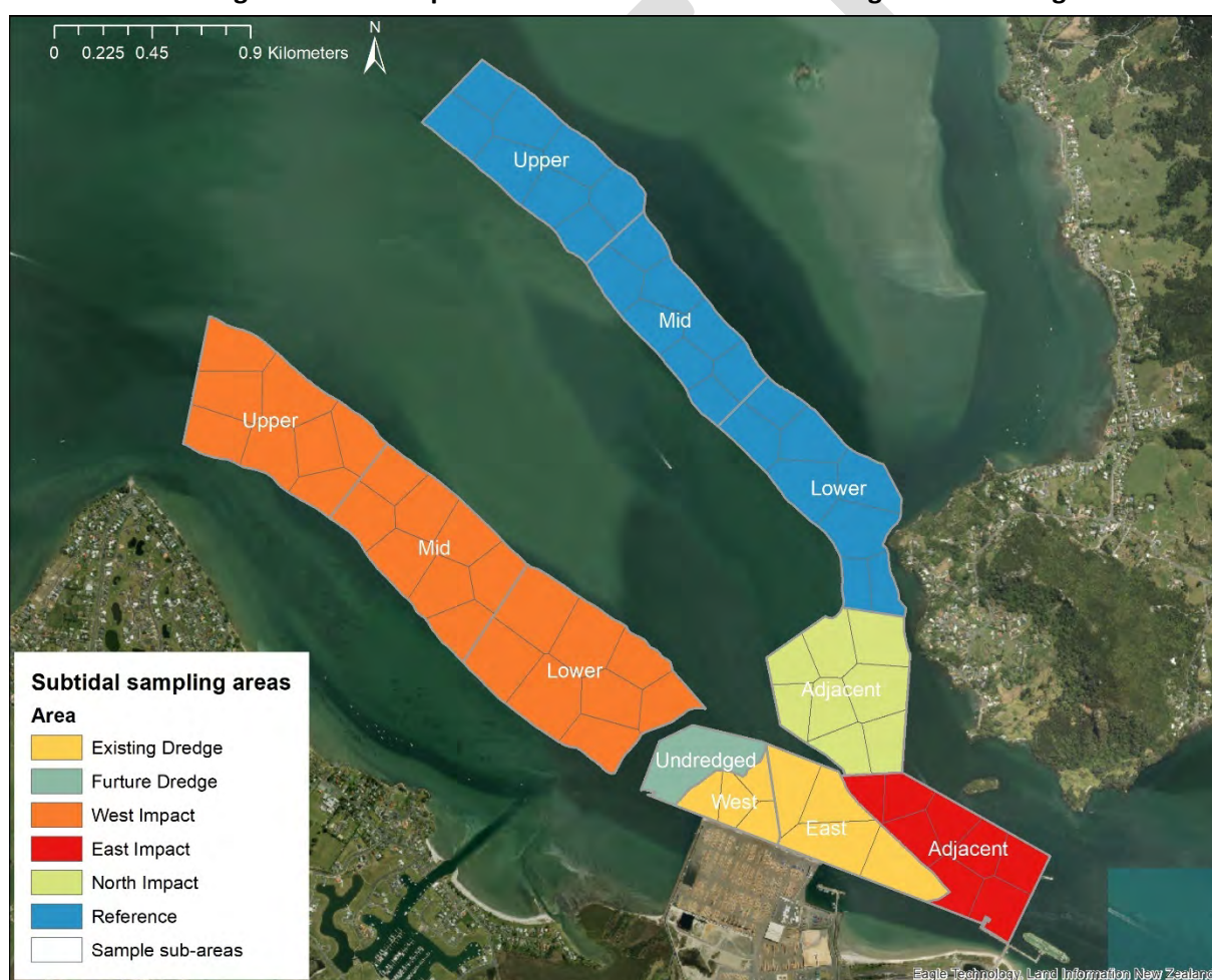
Plan showing indicative sample areas for sub-tidal benthic ecological monitoring