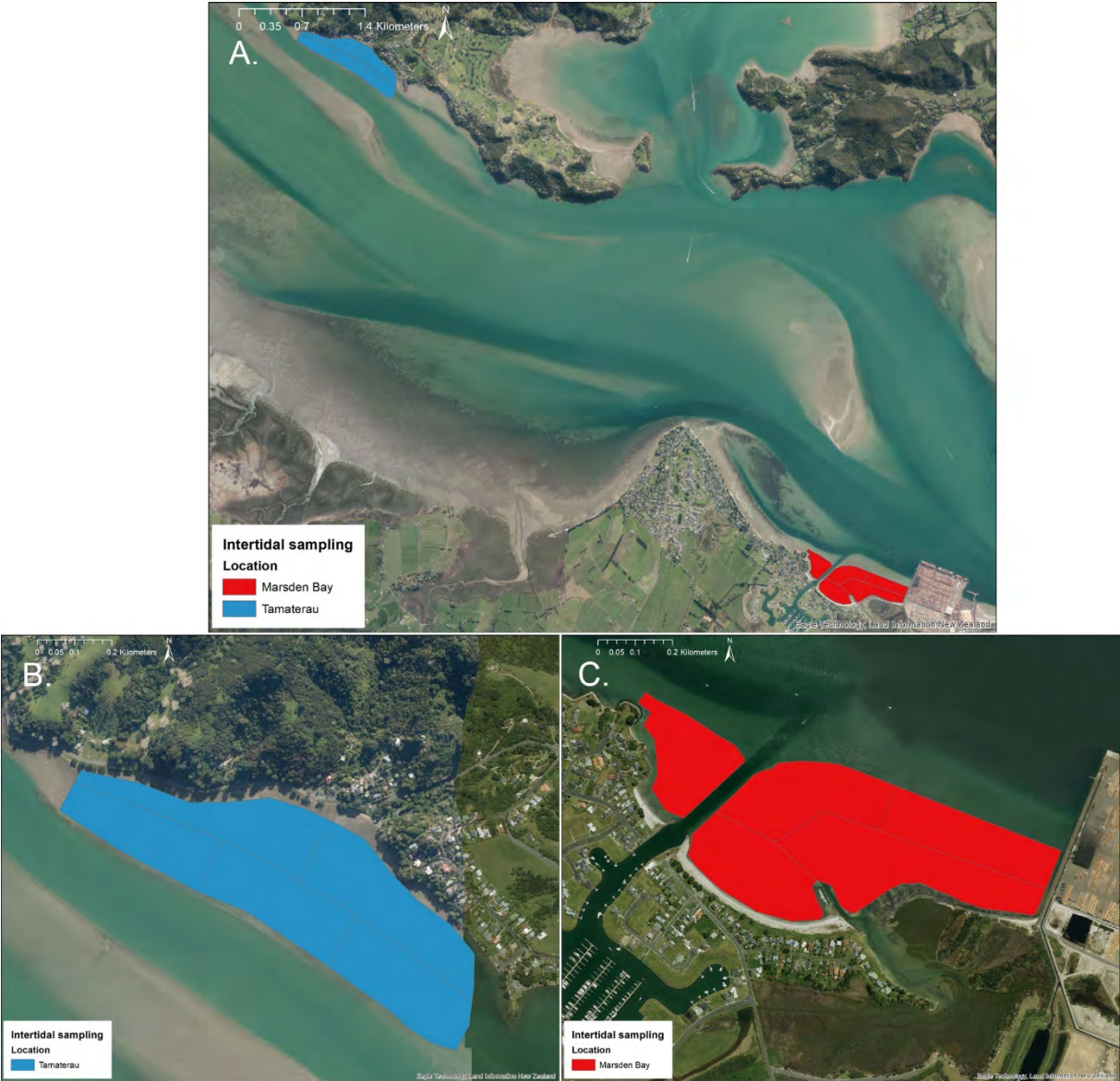
Plan showing indicative sample areas for inter-tidal sediment and infauna monitoring