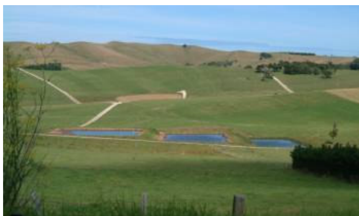
Series of oxidation ponds

The purpose of oxidation ponds is to change the physical and chemical nature of the effluent. To achieve this the effluent should remain in the treatment system for at least 90 days, which enables the settling out of solids and the breakdown of organic material by microbes.