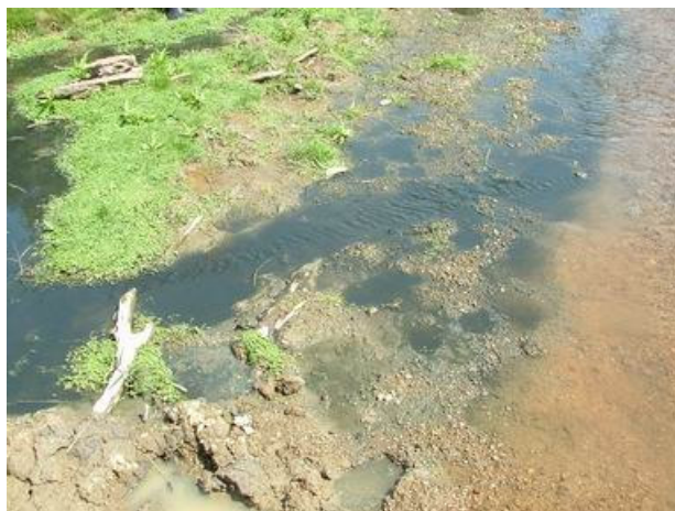
Photo: Poorly treated FDE discharge

The photo above shows discolouration in a stream caused by a FDE discharge.