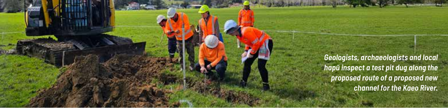
Geologists, archaeologists and local hapū inspect a test pit dug along the proposed route of a proposed new channel for the Kaeo River.