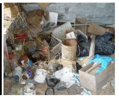
Examples of waste hazardous substances including household cleaners, pool chemicals, insecticides and old, redundant herbicides.