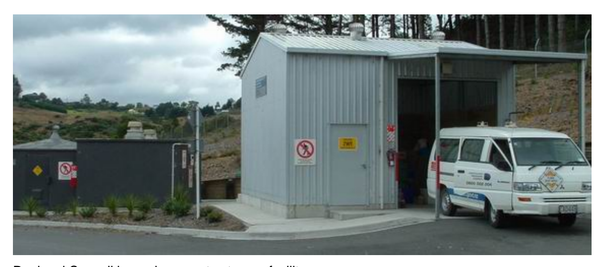
Regional Council hazardous waste storage facility.

The Regional Council facility is specially designed for waste hazardous substances. At this site the hazardous substances are repacked, labelled and placed in temporary storage until being despatched to Auckland for long-term storage or disposal.