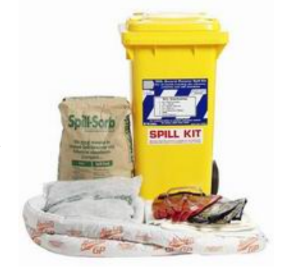
Kit available at service stations for fuel spills

The majority (91% or 938) of these incidents were oil, diesel or other fuel spills, of which 61% (569) were marine spills.