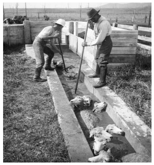
Sheep dipping in New Zealand, around 1924, courtesy of Adkins Collection, Alexander Turnbull Library.

The only site requiring remediation was the public animal dip site at Kaeo that was formerly owned and operated by the Mangonui County Council. The land where this dip was sited is now in public ownership.