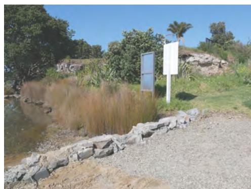
05/10/2020 high tide

Warning - while piecing the information together to create this plan we also note that there is a 300mm height discrepancy.