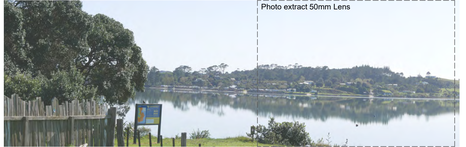
Photo extract 50mm Lens