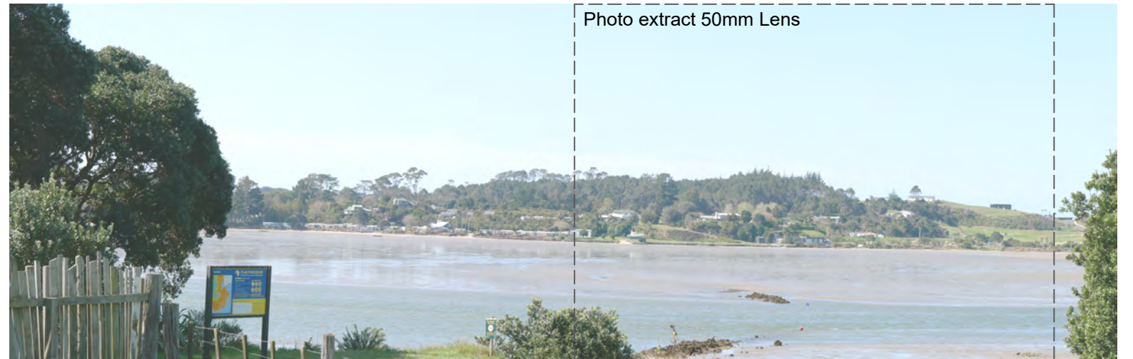
Photo extract 50mm Lens