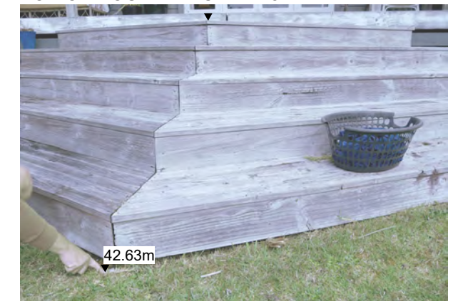
TOP OF HOUSE DECK 42.75m

ADDRESS MANGAWHAI VILLAGE CLIENT / APPLICANT MANGAWHAI WHARF TRUST