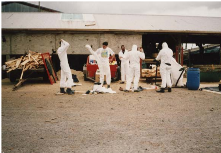
Contaminated site cleanup

A 1992 Ministry for the Environment study concluded that about 400 potentially contaminated sites exist within the Northland Region. These range from landfill sites to closed gasworks sites and oil terminals.