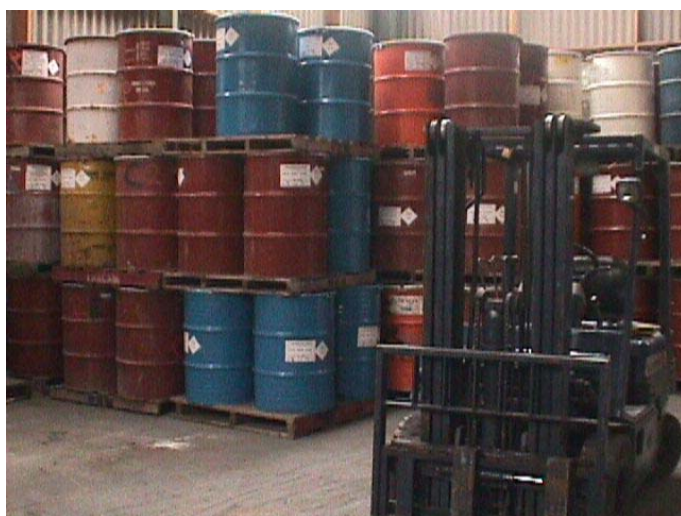
Stockpiled waste hazardous substances

There is a wide range of substances that fall into these categories. There are around 450 industrial sites in the Northland Region that on a routine basis use hazardous substances as part of their manufacturing process.