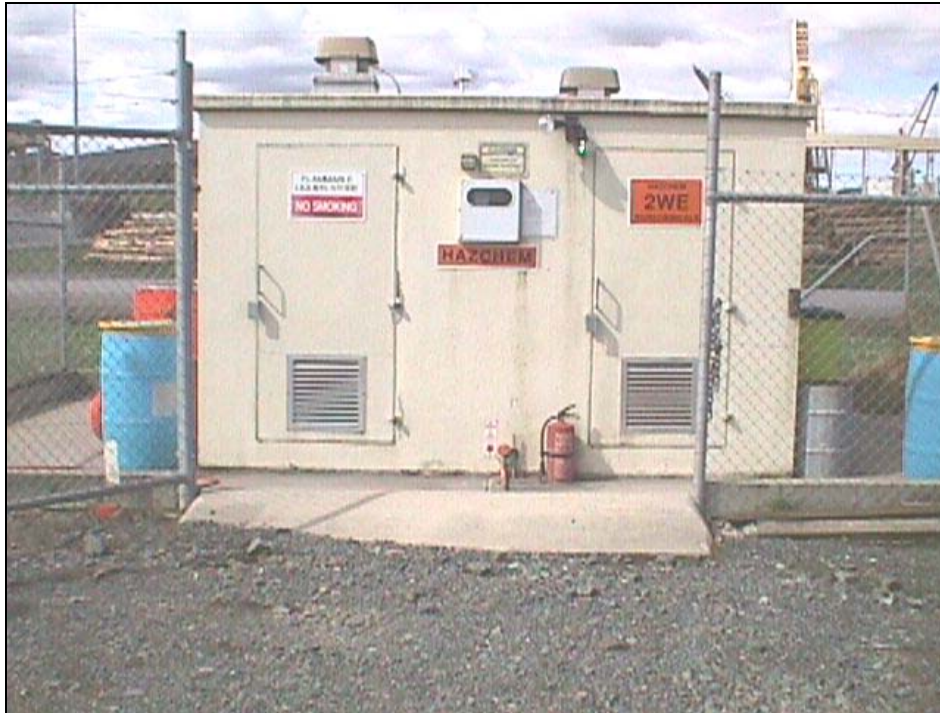
Hazardous wastes store

Recognising the risks that many of these substances may have on the environment the Northland Regional Council has since 1993 continued to provide an ongoing service for the collection, storage and disposal of waste hazardous substances. In conjunction with Wrightson, four agricultural chemical depots are located at Kaitia, Waipapa, Dargaville and Whangarei. An additional purpose-built store is also located in Whangarei. This store is used for the temporary storage of the higher risk chemicals prior to despatching them to Auckland.