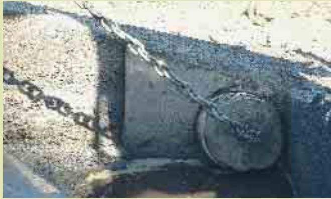
Inexpensive stormwater control. Pipe to pond blocked when yard clean.