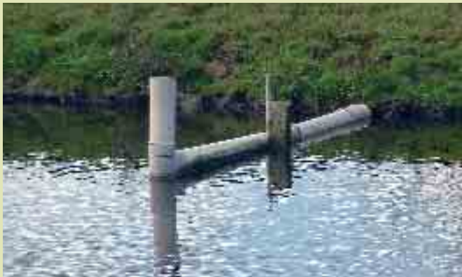
A well set-up "Tee" and discharge pipe.