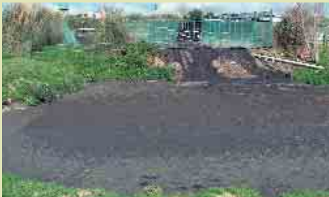
Feed pads need increased treatment capacity.