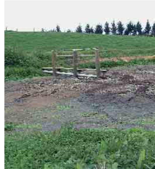
Good pipework but excessive solids and weeds in anaerobic pond.