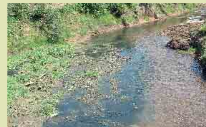
Poor quality discharge polluting a stream.