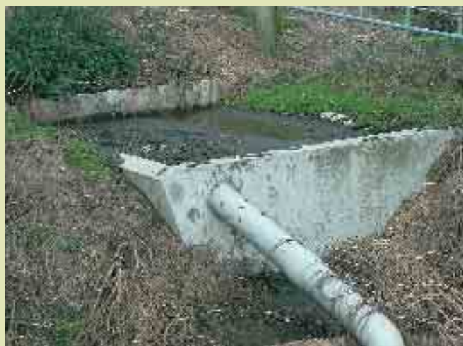
Drive-in gravel trap, not working. Must be cleaned regularly.

Keep rubber gloves, cows' tails, bits of wood and other rubbish out. Blocked pipes will cause systems to fail.