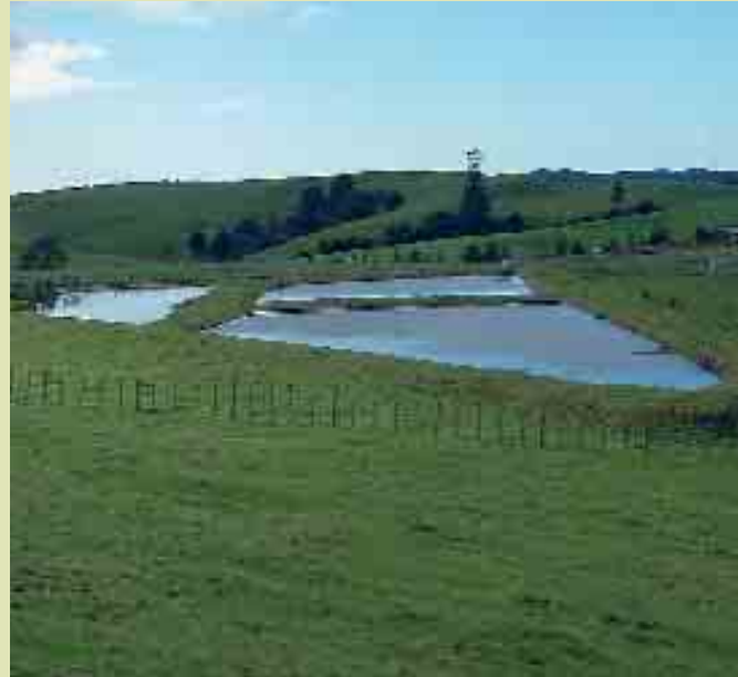
Two well designed, constructed and managed pond systems. The photograph (above) shows the last three ponds in a four pond system. The third pond in the photograph (below) discharges to a constructed wetland.