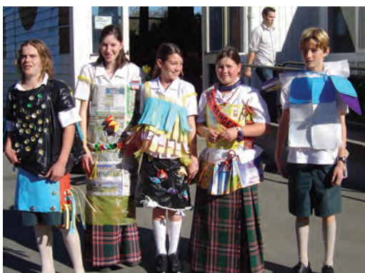
(A) 6 x 4cm finished size @ 300dpi

All images need to be converted to CMYK - NOT RGB