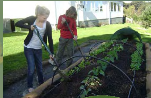
Vegetable Gardens - working with children