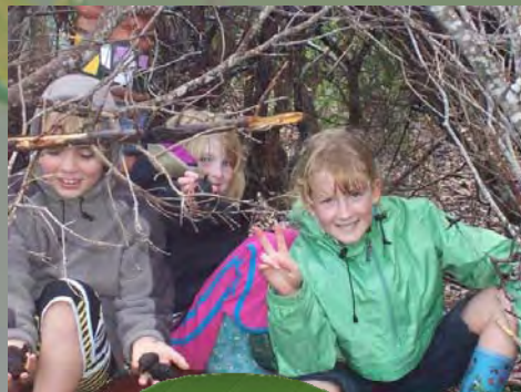
Fern Valley Children visiting from Glenbervie

This highly valued, special area at the foot of Manaia was designed and created by our students as an on-going project to regenerate native bush. This year our Year 7 and 8 technology class completed an information board outlining the native species growing there, to encourage our extended school community to learn about our native plants. On Arbor Day, students planted more trees in Fern Valley – to sustain the growth of this area. Recently, we hosted Glenbervie School's Enviro Group who wanted to find out more about what we have achieved at our school.