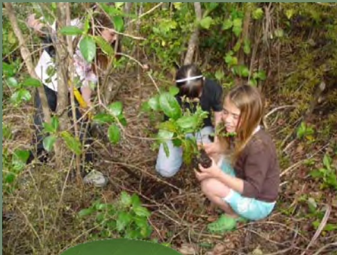
Fern Valley Planting trees for Arbor Day